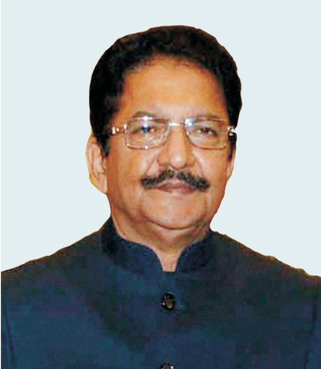
Thiru CH. VIDYASAGAR RAO (Addl. Charge) Hon'ble Governor of Tamil Nadu and Chancellor of the University (from 02.09.2016 to 06.10.2017)