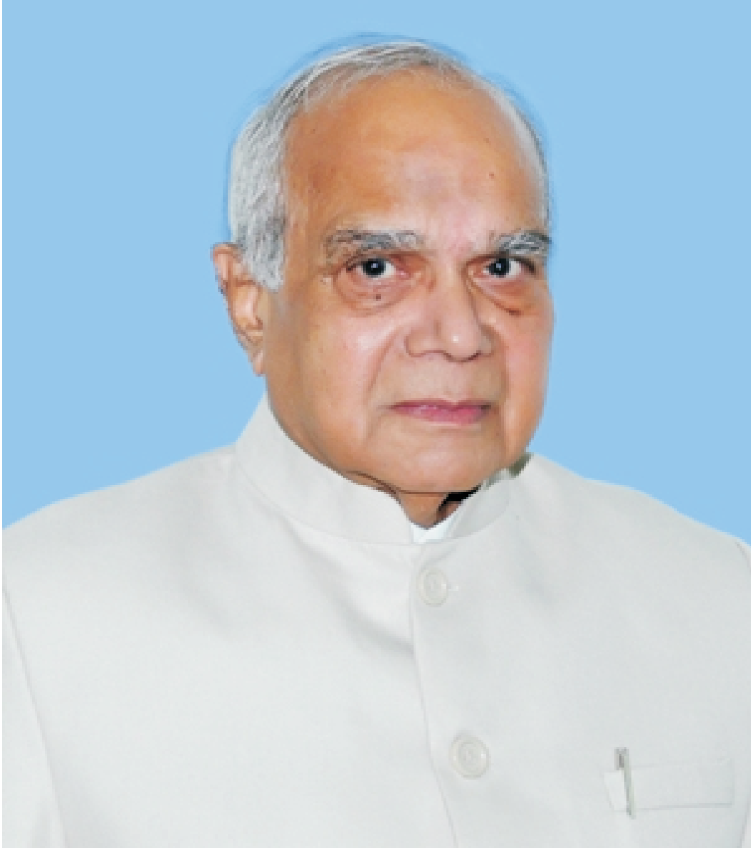
Thiru BANWARILAL PUROHIT Hon'ble Governor of Tamil Nadu and Chancellor of the University (from 06.10.2017)