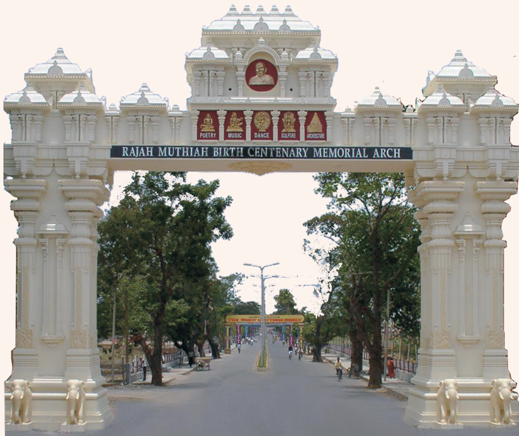
Rajah Muthiah Birth Centenary Memorial Arch