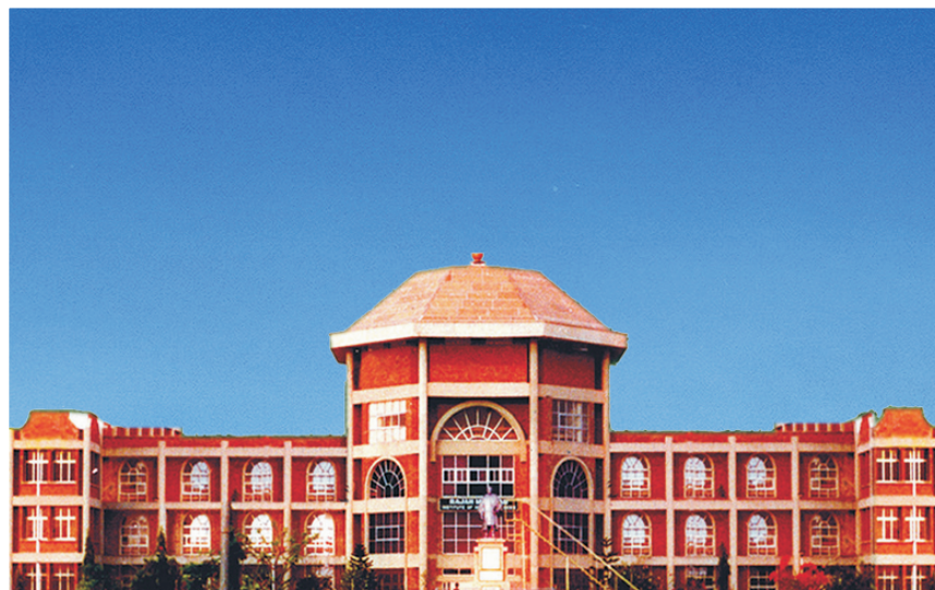
Rajah Muthiah Institute of Health Sciences