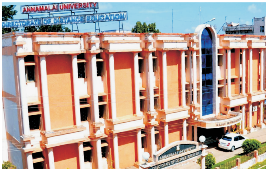
Directorate of Distance Education