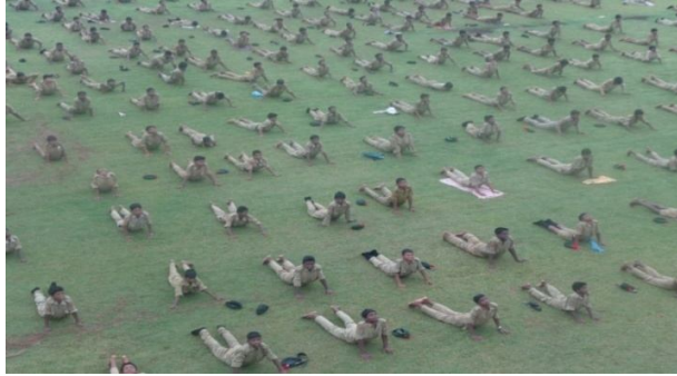
International Yoga Day on 21 Jun 2016 at Neyveli Centre