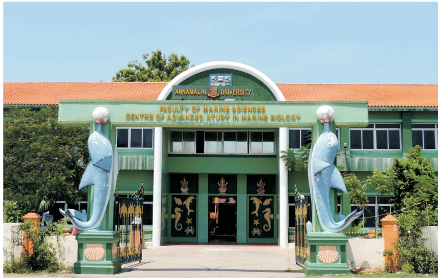
Faculty of Marine Sciences