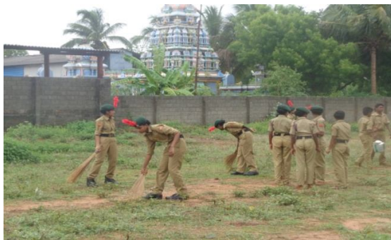
Cleaning activities carried out by SW Cadets of FEAT at Neyveli

Cleaning activities are carried out by NCC Cadets with respect to Swachh Bharat Abiyan during ATC and other then camps. Some cleaning activities like Cleaning of surrounding area, Collection and disposal of plastic, Tree plantation, Awareness campaigns, Maintenance of community areas are carried out by NCC cadets during this year.