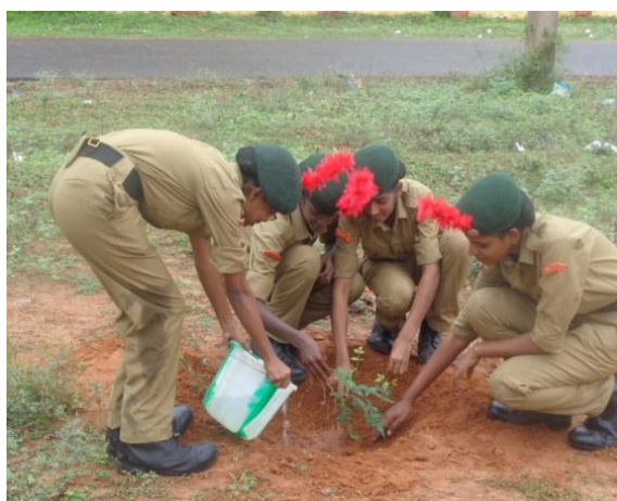
Sapling planted by SW Cadets of FEAT at NLC Boys Hr Sec School, Neyveli during ATC.

The ANOs and Cadets have participated in various social service activities during the year 2016. Some of the social service activities carried out by them are: Tree plantation, AIDS Awareness rally, National Safety awareness rally, Rain water Harvesting Awareness rally, world sight Day awareness rally, Public control activities at various ATM centre.